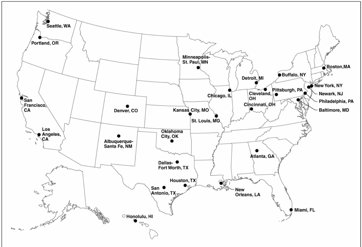
Figure 1: Location of the 28 FEBs