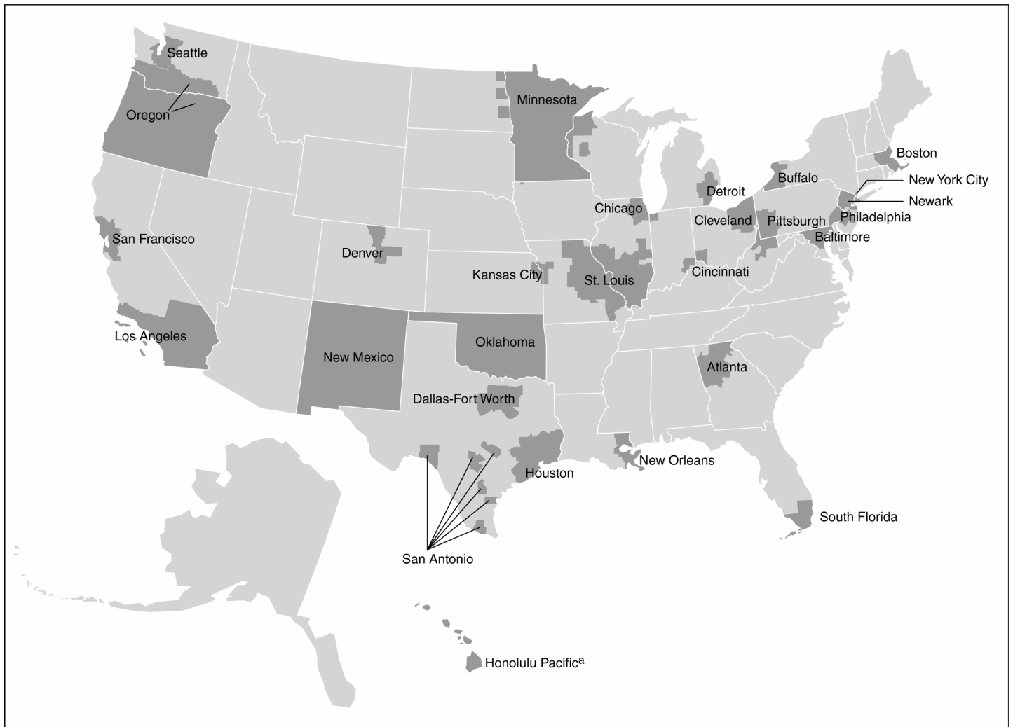
Figure 2: Jurisdictional Boundaries of the 28 FEBs